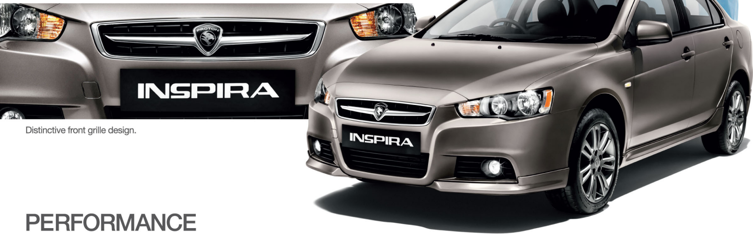
Distinctive front grille design.