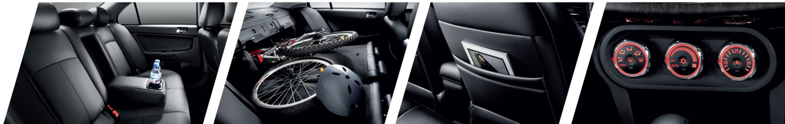
Roomy cabin space with ergonomically designed seats for pure comfort.