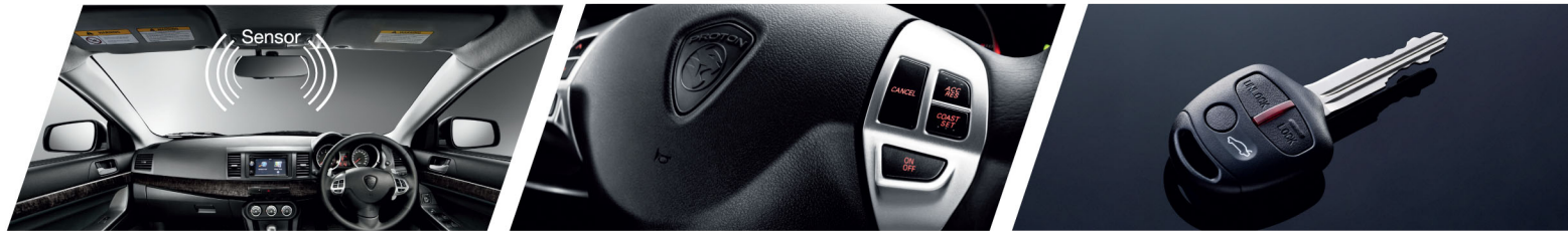
The rain sensor triggers the wipers when there is rain. The auto light sensor automatically turns on your headlights when driving and approaching dark areas.