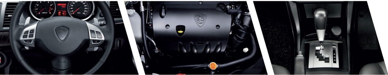
Sport Mode with Paddle Shift The sport mode features a 6-step shift control that delivers a smoother drive.